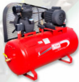
Beat - 10ES