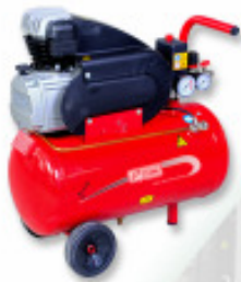
Beat - 10D to 20D

Piston : Equalized and balanced pistons are made from aluminium material. Each piston has compression rings and oil control rings for optimum efficiency.