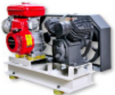
Engine driven compressor