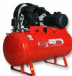
Beat - 20ES to 50ES