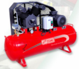
Beat - 30S to 75S